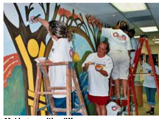
Making a positive difference