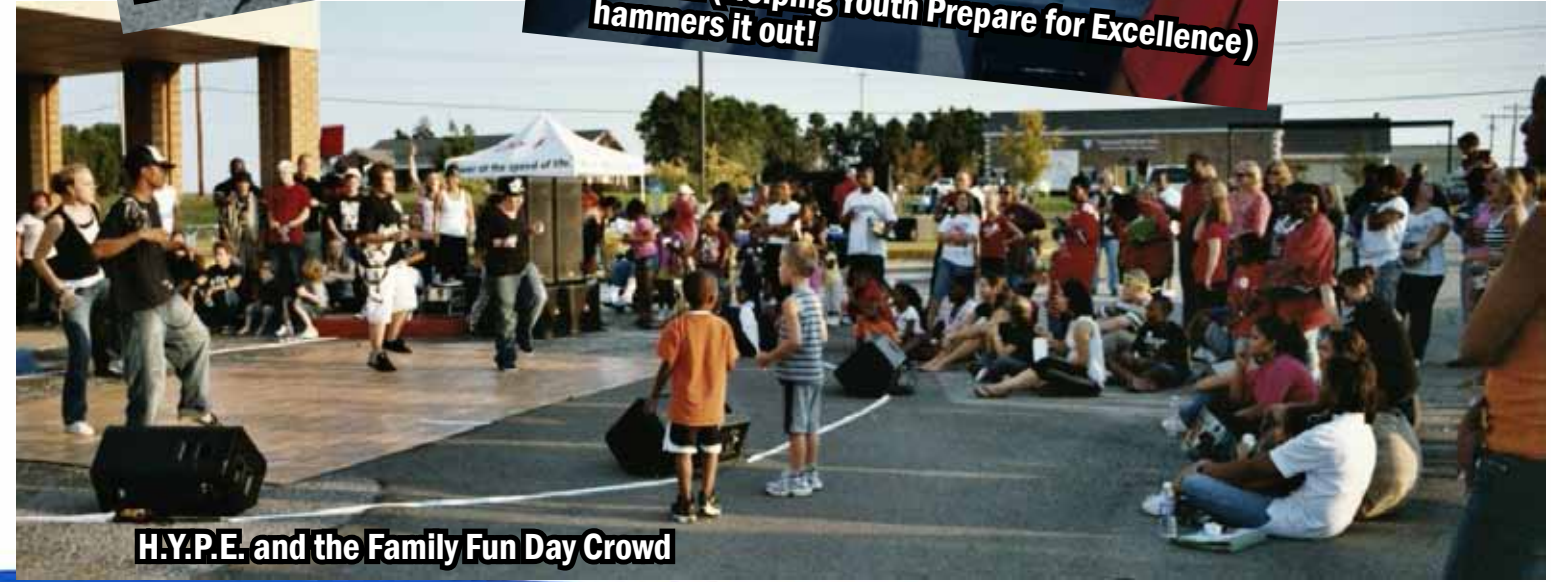
H.Y.P.E. and the Family Fun Day Crowd