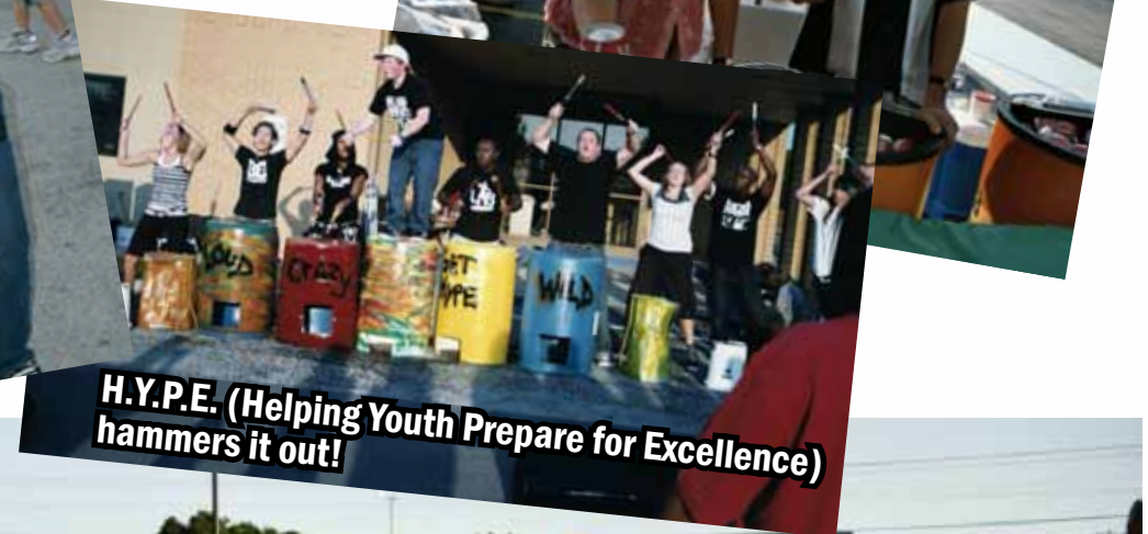
H.Y.P.E. (Helping Youth Prepare for Excellence) hammers it out!