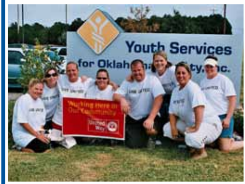
Enterprise Rent-A-Car Employees Really Care!