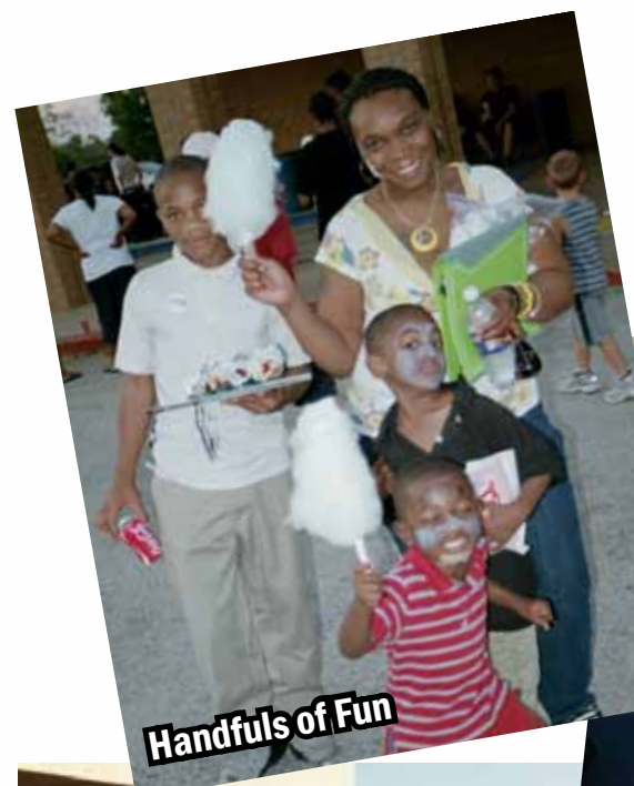
Handfuls of Fun